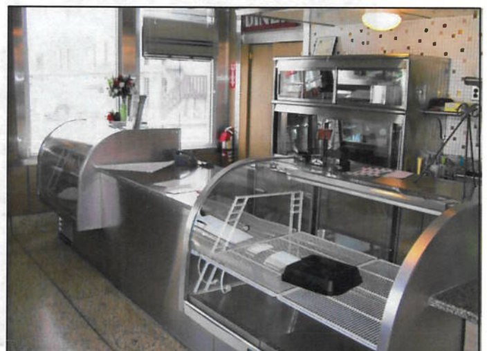
Baked Goods Display Area