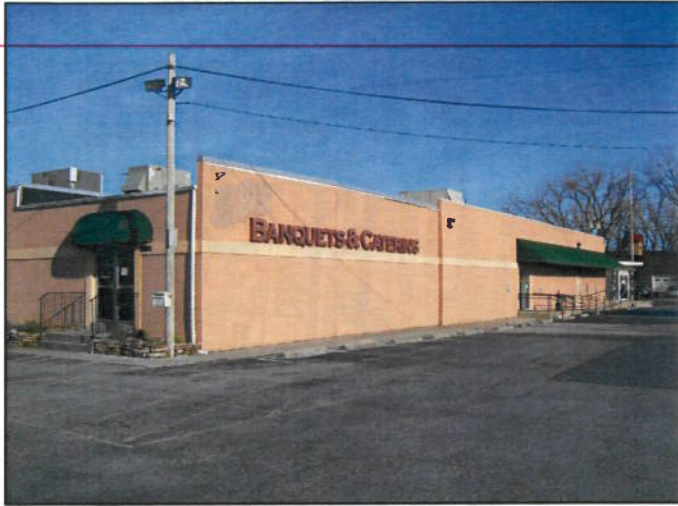
East Side Looking Northwest