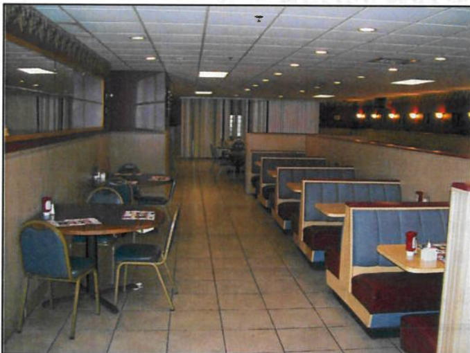
Main Dining Room Looking South