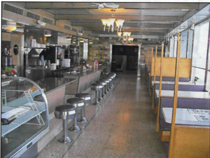
Diner Portion Looking West