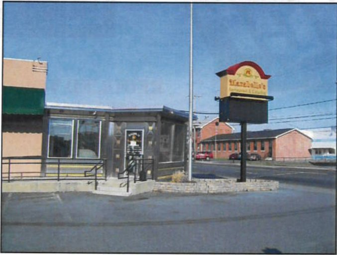
Main Entrance Looking Northwest