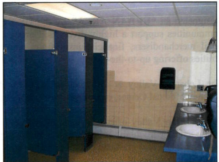
Handicap Accessible Restrooms