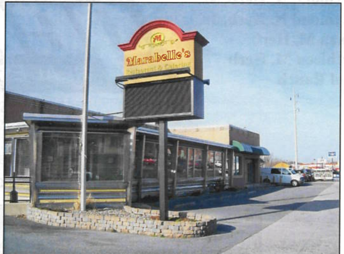
Diner Portion Looking Southwest