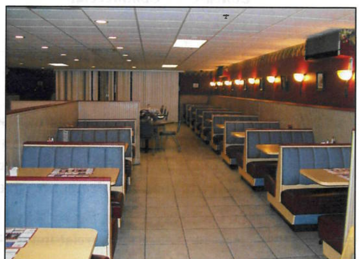
Main Dining Room Looking South