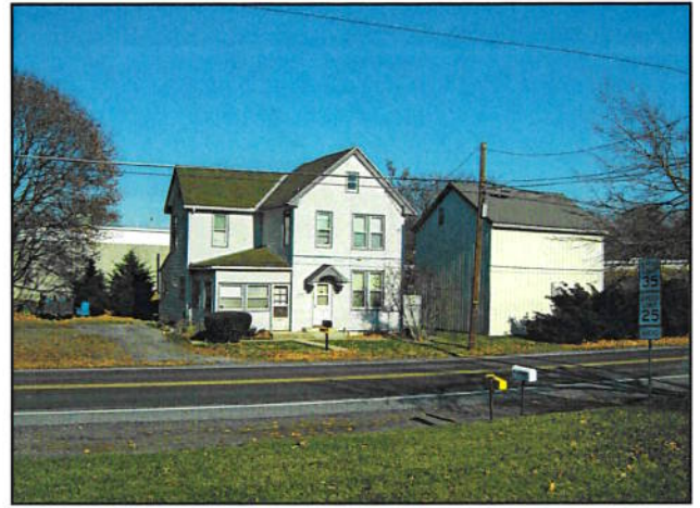
Rental Home & Storage Building