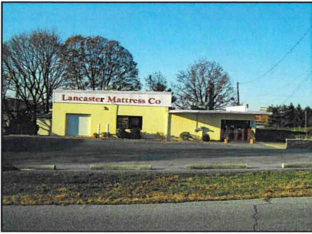
Side View of Property